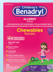
Children's BENADRYL® Chewables†