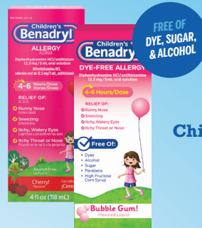
Children's BENADRYL® Allergy Liquid†‡